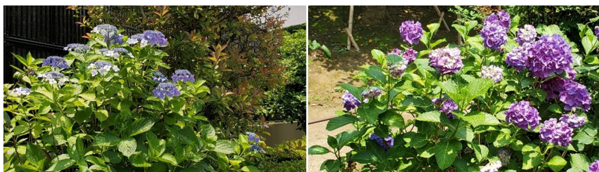
Two varieties of hydrangea, a flower currently in bloom and associated with the rainy season in Japan.

Greetings from The Nippon Foundation. The weather in Tokyo is currently transitioning from spring to summer, with the temperature earlier this week surpassing 30° C for the first time this year. This week would mark the beginning of the rainy season in an average year, but it appears that this year's start is still at least a few days away. In coronavirus-related news, the state of emergency declared in late April for Tokyo, Osaka, and several other prefectures has been extended to June 20. An encouraging development, however, is that the pace of vaccinations is picking up. In addition to the original program being carried out by local municipal governments, large-scale vaccination centers have begun operating in Tokyo and Osaka, and large companies and universities are preparing to begin offering on-site vaccinations to employees and their families and to students later this month.