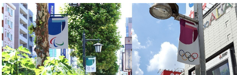
Banners for the Tokyo Olympic and Paralympic Games flying in Tokyo

Greetings from The Nippon Foundation. After a one-year delay due to the coronavirus pandemic, the 2020 Tokyo Olympic Games concluded on the evening of Sunday, August 8. Initial public apprehension over holding the Games during a fourth coronavirus state of emergency began to ease somewhat once the competitions got underway, especially as Japanese athletes started winning what would become a record number of both gold medals and total medals for the country. Most events were held without spectators and bars and restaurants were closed or not serving alcohol under the state of emergency, however, meaning that people watched the events at home on television instead of attending in person or gathering with friends. In addition, with no spectators from overseas and the athletes, Olympic officials, and members of the overseas media spending their time in self-contained bubbles to prevent the spread of infections, the festive atmosphere that would normally be the case throughout the city was missing. Nevertheless, the performances of the Olympians provided excitement and inspiration to viewers in Japan and around the world. Now that the Olympic athletes have returned home, attention is turning to the Paralympic Games, which are scheduled to open on August 24.