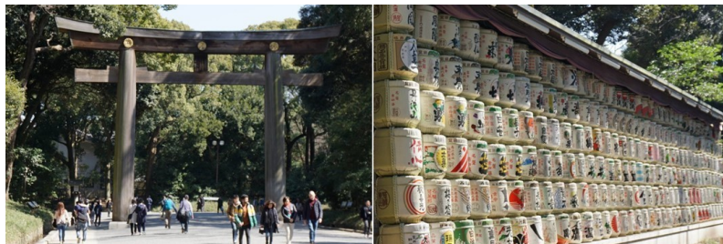
Meiji Shrine in Tokyo is dedicated to the Emperor Meiji. On the shrine grounds, a 'torii' gate on a path leading to the shrine (left) and barrels from sake donated to the shrine by brewers from around Japan (right).

Greetings from The Nippon Foundation. Japan observes two public holidays during November. The first is Culture Day, on November 3. The date is the birthday of the Emperor Meiji, who from 1868 led Japan from an official policy of isolation to become a modern nation. Normally, schools hold culture festivals for classes and clubs to demonstrate their activities, although these events are being curtailed again this year to prevent the spread of coronavirus infections. The government also announces the recipients of various awards for cultural achievement on this day. The second holiday is Labor Thanksgiving Day, on November 23, to honor labor and production. This holiday traces its roots to the ancient Niinamesai harvest festival, which dates to the seventh century. Also, although not an official public holiday, November is the month of Shichi-Go-San (7-5-3) to celebrate and wish for the health and growth of girls aged three and seven and boys aged five. Around November 15, many of these children visit Shinto shrines with their families, with girls dressed in colorful kimono and boys in a kimono or suit, making this a popular occasion for photographs.