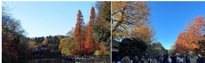
Inokashira Park, with the Benzaiten Shrine in the background (left) and visitors enjoying the foliage along Inui Street on the Imperial Palace grounds (right)

Inokashira Park in Tokyo's western suburbs is a popular place to visit for both its sakura blossoms in the spring and momiji foliage in the fall. The park encompasses a large pond, which is the source of the Kanda River that flows eastward through the city and into Tokyo Bay, as well as a zoo, and a shrine dedicated to the goddess Benzaiten. The grounds of the Imperial Palace in central Tokyo are another large green urban oasis. Although mostly closed to the public, a section along Inui Street is opened twice a year to allow people to enjoy its sakura blossoms in the spring and momiji in the fall. This year, the street was opened to the public for nine days from late November through early December, for the first time in three years after having remained closed as a coronavirus prevention measure. On the first day, 50 people were already waiting at the gate by the time the street opened.