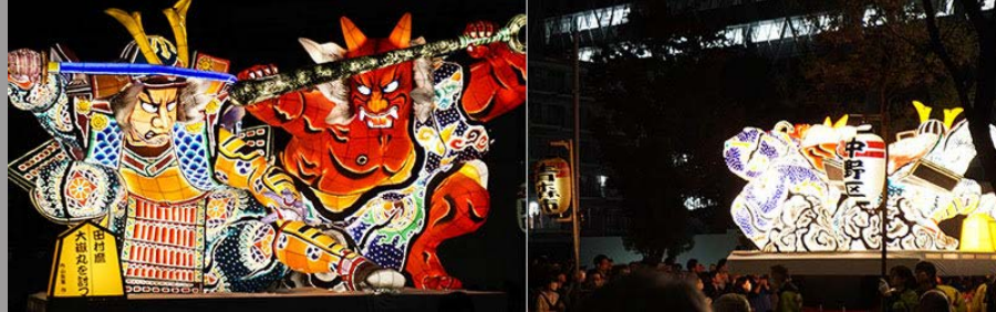
A float depicting warrior figures (left-hand photo) at this year's festival in Nakano, and a float preceded by lanterns (right-hand photo) with the characters for Aomori City (left) and Nakano City (right) written on them

Greetings from The Nippon Foundation. The Aomori Nebuta Matsuri is a popular summer festival that takes place in early August in Aomori City in Aomori Prefecture, the northernmost prefecture on Japan's main island of Honshu. The festival features a procession of large, illuminated floats of warrior figures accompanied by taiko drums, musicians, and dancers, and is one of Japan's largest and most famous summer festivals. In a show of support following the Great East Japan Earthquake that struck northeastern Japan in March 2011, Tokyo's Nakano ward (officially "Nakano City") has been holding its own nebuta festival since 2012. In addition to a parade of nebuta floats, stalls are set up with vendors selling regional foods and other items and tourism-related organizations providing tourist information. This year, the name of the festival, which was held on October 28 and 29, was changed from "Tohoku Reconstruction Festival Nakano" to "Nakano Festival to Support Tohoku," as the emphasis has shifted from post-disaster recovery to more general support, cultural exchanges, and regional vitalization, with the hope of building deeper ties between the Tohoku region and Nakano.