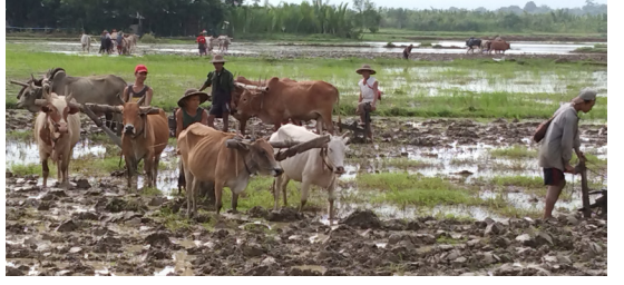
Some villages utilize the development fund to cultivate rice paddies.

We have been implementing a school building/repair project in Shan State, Kayah State, Rakhine State, and the Ayeyarwady Region since 2002. Children's parents and local residents collect part of the expenses, and the money collected is secured as a "development fund." The fund is directed to rice paddy development and water treatment projects, which are necessary for local communities to develop independently, as well as to cover the operational costs of dormitories for students living far away from school.