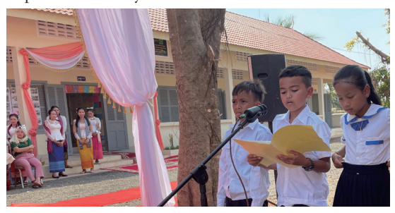
Students are now able to focus on their studies in the new school building

In the late 1990s, we built 100 schools in a region formerly controlled by the Khmer Rouge and which was greatly impacted by the Cambodian genocide. Since then, we have provided support with a focus on intangible areas, such as training teachers who are responsible for teaching children. In 2023, we launched a new school building project in Tboung Khmum province in east Cambodia, based on a project implemented in Myanmar.