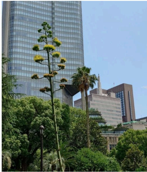
The blooming agave 'century plant' in central Tokyo's Hibiya Park