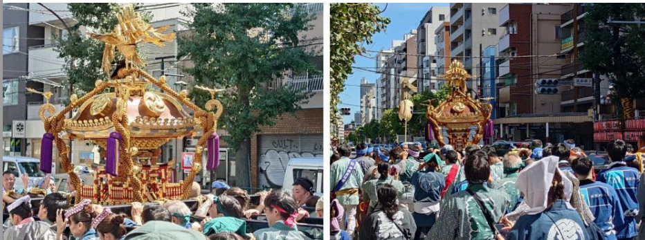
Local residents wearing happi coats carry a mikoshi portable shrine through their Tokyo neighborhood in mid-September

Greetings from The Nippon Foundation. September is when many communities in Tokyo hold their local matsuri , or festival. Many festivals are held across Japan throughout the year on seasonal or other themes like the blooming of sakura cherry blossoms in the spring, bon odori dance festivals during the summer Bon holiday season, fireworks festivals held throughout the year, and summer community festivals held by local merchants' associations. When used on its own, however, the term "matsuri" usually refers to a festival associated with a community's local Shinto shrine. Some are large and famous, like Kyoto's Gion Matsuri and the Sanja Matsuri in Tokyo's Asakusa neighborhood, but ordinary residential areas have their own matsuri associated with a neighborhood shrine as well. Wearing traditional happi coats, members of the community carry a portable shrine, called a mikoshi (or o-mikoshi ) through the streets of the neighborhood. This is the only time during the year that the mikoshi leaves the shrine grounds, and is said to enable to community to give thanks to the deity enshrined there and for the deity to visit the community, spread good fortune, and absorb or prevent bad fortune.