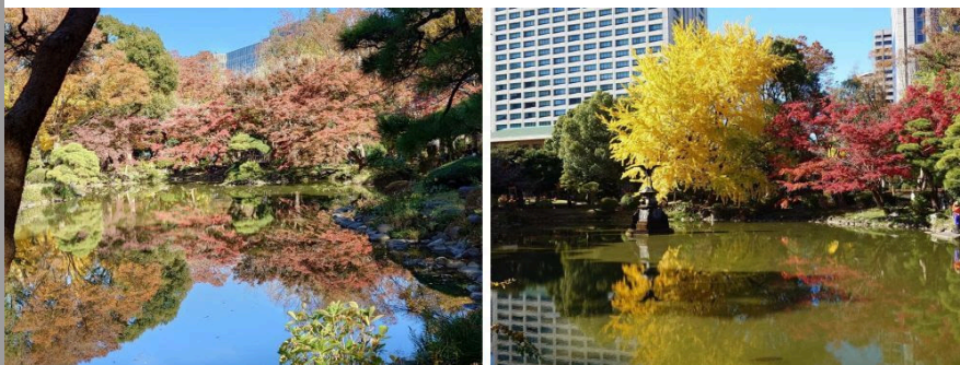
Autumn foliage on a recent afternoon in Hibiya Park in downtown Tokyo, next to the grounds of the Imperial Palace

Greetings from The Nippon Foundation. December in Japan is a busy time for many people. Year-end traditions include sending year-end gifts (called o-seibo ) to business customers and people who have shown you kindness during the past year, preparing and sending New Year's cards ( nengajo ), year-end gatherings with friends and work colleagues ( bonenkai ), and a thorough housecleaning ( o-soji ). It is no wonder that by the time the New Year's holidays finally arrive, many people want to spend them at home doing practically nothing at all ( ne-shogatsu , which translates as "sleeping New Year"). Traditionally, special dishes called osechi-ryori are prepared to be eaten over the holidays, or can be purchased in advance and delivered on New Year's Day. The official public holidays are from December 31 to January 3, and many companies and shops are closed for a week or more, making this one of the busiest travel times of the year. With many people returning to their hometowns to visit relatives or traveling for leisure within Japan or overseas, it is also a relaxing time to be in large cities like Tokyo that become relatively quiet for a few days.