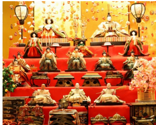
Displays of hina dolls

Greetings from The Nippon Foundation. Hina matsuri is a festival observed in Japan on March 3. Referred to as both the Doll Festival and Girls' Day in English, this is a day when households with young girls display ornamental dolls to wish for the girls' health and happiness, and traditionally for a happy marriage as well ( hina refers to the dolls and matsuri is the Japanese word for "festival"). The dolls are dressed in imperial court clothing of the Heian Period (794-1185) and arranged in the style of a court wedding, with the two main dolls representing the emperor and empress. The displays are covered with red cloth and can have one, five, seven, or